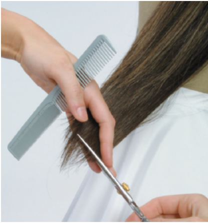
figure 19-10 Free-form cutting with vertical sections