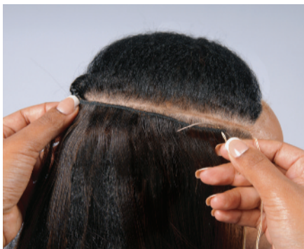
figure 19-37 Sew weft to braid.