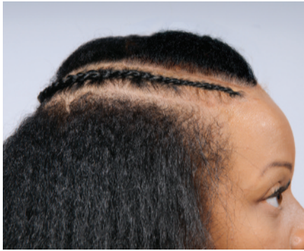
figure 19-35 Cornrow braid track