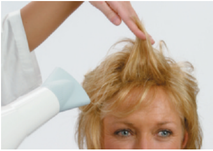
figure 19-14 The wind test

away from her face. Gently blow around the client's face with a blow dryer set at cool and low. Observe how the hairline looks. Does it seem realistic? If so, point out the results to the client, who may be feeling insecure about whether the wig looks natural enough ( figure 19-14 ).