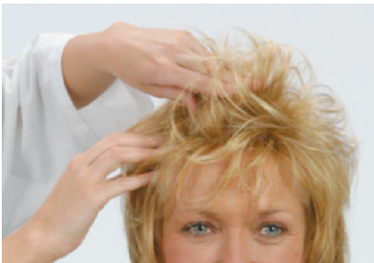
figure 19-15 Style with the fingers for a natural look.

When coloring a human hair wig or hair addition, conduct regular color checks every five to ten minutes. Remember that the hair you are working on did not come from one head, but from many different heads, so it may be unpredictable. Often, it is easier to color the client's hair to match a hair addition than to color the addition itself.