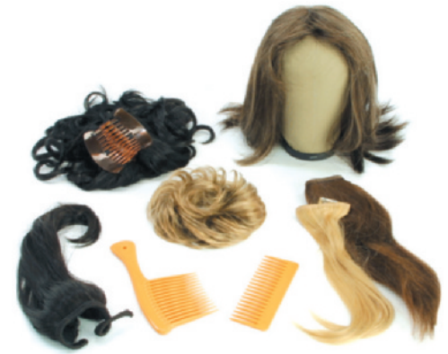
figure 19-5 Wigs and hairpieces come in a wide range of styles and colors.

LO3 Examine the two basic categories of wigs.