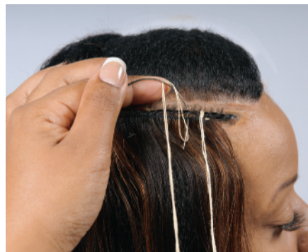
figure 19-38 Wrap the thread around the needle.