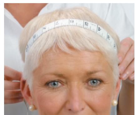
figure 19-9 Measuring from ear to ear over the crown