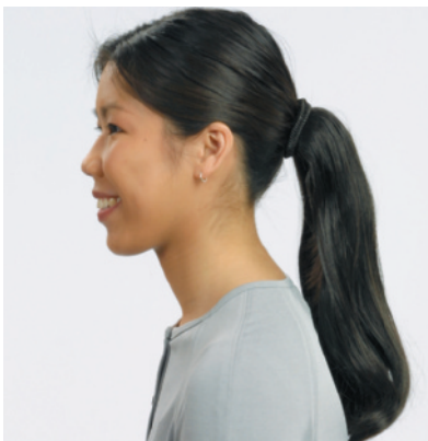
figure 19-25 Same client with a new, much longer ponytail