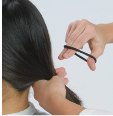
figure 19-22 Client's own ponytail