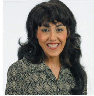
figure 19-30 Cascade of curls