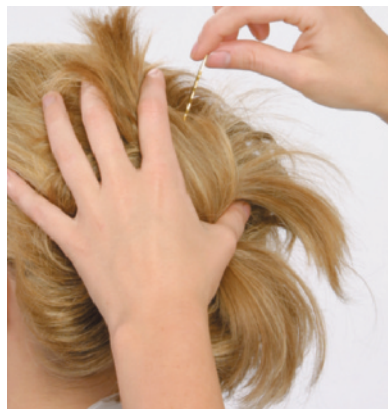
figure 19-33 Securing the hairpiece with hairpins