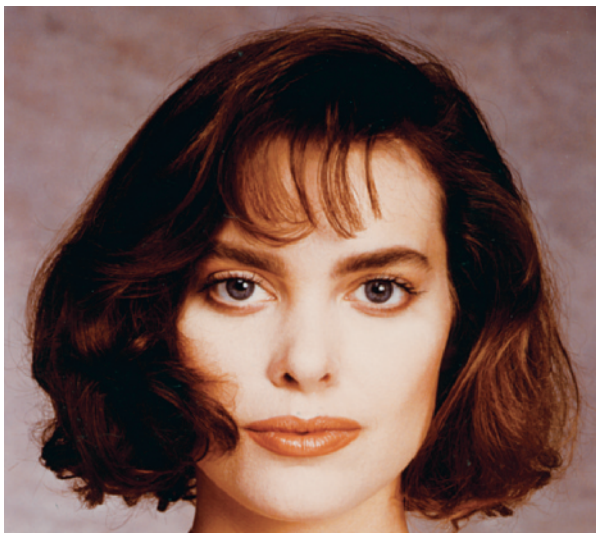
figure 19-42 Before braid and sew extensions

In the bonding method of attaching hair extensions, hair wefts or single strands are attached with an adhesive or bonding agent.