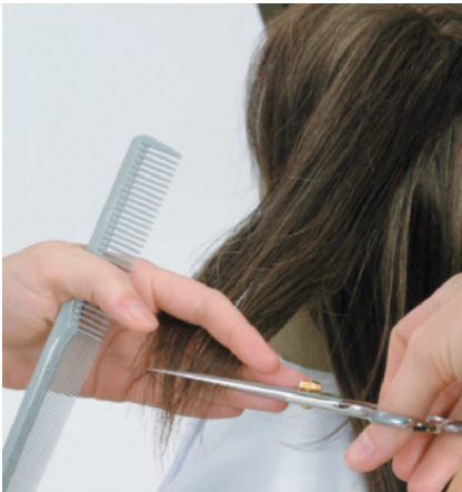
figure 19-11 Free-form cutting with diagonal sections