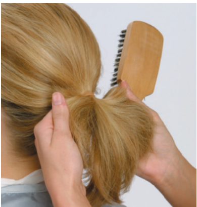
figure 19-32 Brushing client's hair into a ponytail

Hair extensions represent an increasingly popular salon service, not only for clients who are looking for something different but also for those