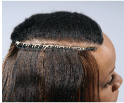
figure 19-41 Complete line of overcast stitching