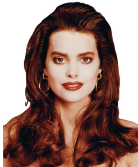
figure 19-43 After braid and sew extensions