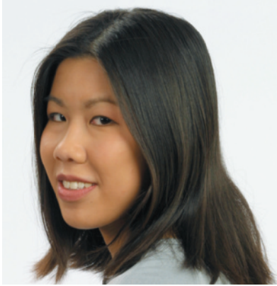
figure 19-21 A client before fitting with a wraparound ponytail