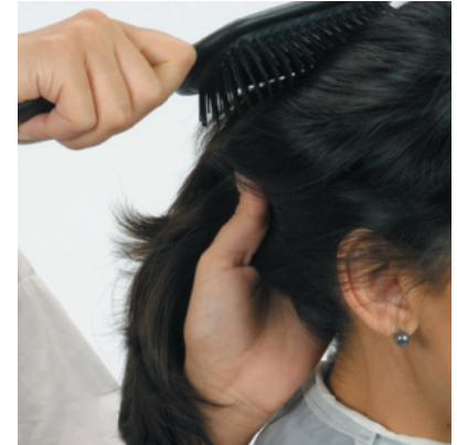
figure 19-27 Brushing the client's hair into a ponytail