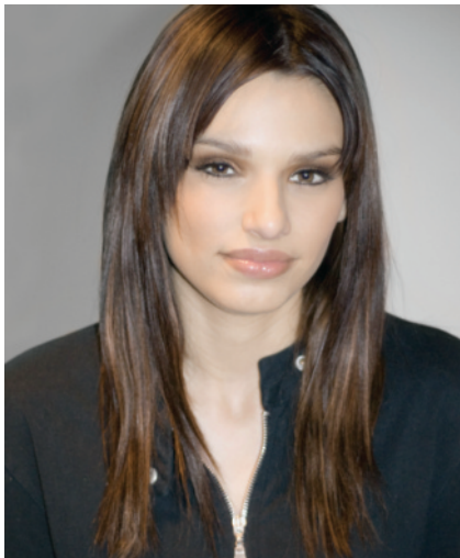
figure 19-1 Client before getting hair extension