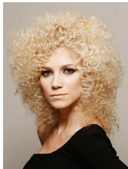
Hair: Thresa Venable, Sheer Professionals Salon & Spa.