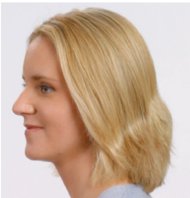
figure 19-31 Client before fitting with a hair wrap

After reading the next few sections, you will be able to: