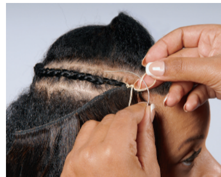
figure 19-39 Form lock stitch.