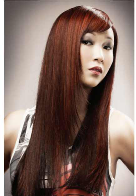
figure 19-46 Hair extensions using the fusion bonding attachment method