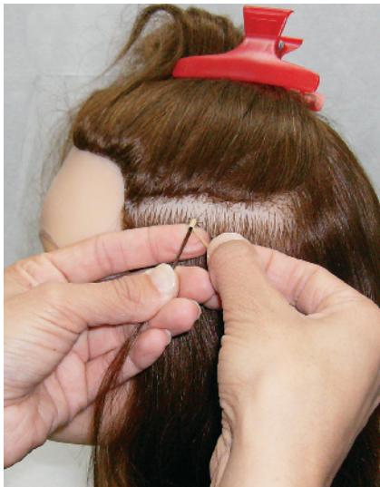
figure 19-47 Linking