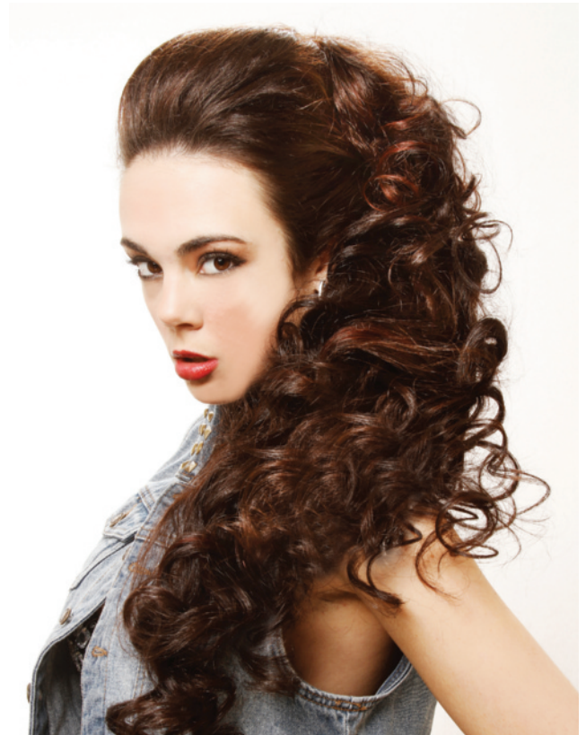
Academy Pro Hair Extensions.