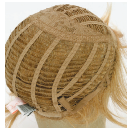
figure 19-6 A capless wig

In general, capless wigs are healthier, because they allow the scalp to breathe and because they prevent excess perspiration. A cap wig is best