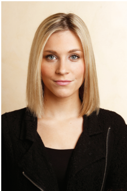
figure 19-44 Client before bonding hair attachment method