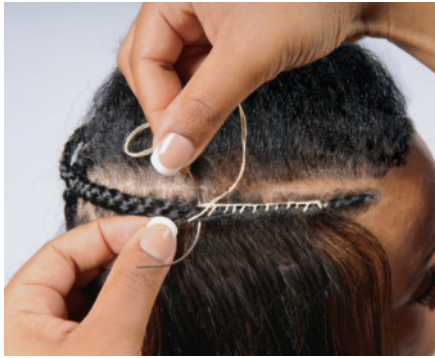
figure 19-40 Finished overcast stitches