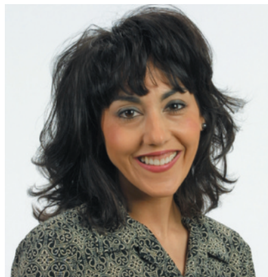
figure 19-26 Client before fitting with comb-attached curls