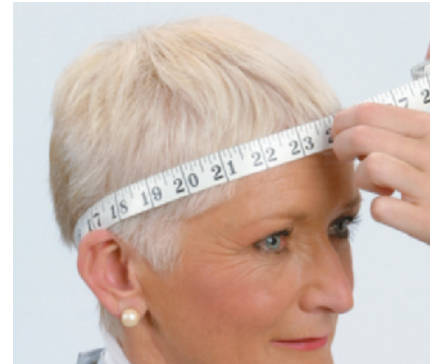
figure 19-7 Measuring the circumference of the head

One of the most important steps in the wig service is instructing the client on how to put on the wig. Start by educating the client on the correct