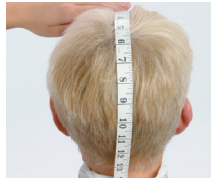
figure 19-8 Measuring from the front to the nape