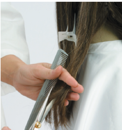
figure 19-12 Free-form cutting with horizontal sections

method for preparing her hair. The client's skill at securing her hair under the wig cap and making it flat and even will determine how well the wig sits on her head. If the wig does not fit properly—for instance if it is too large and does not have tightening straps or elastic—you can create a small fold or tuck and sew the wig along the inside to create a seam. To shorten the wig from front to nape and remove bulk, create a horizontal tuck or fold across the back. To remove width at the back, create a vertical tuck and sew it in place. Keep in mind that sewing the wig to create a customized fit is a highly specialized art.