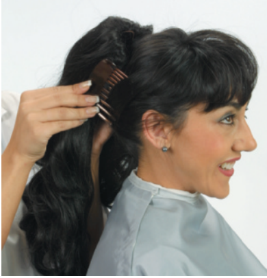
figure 19-28 Attaching the combs