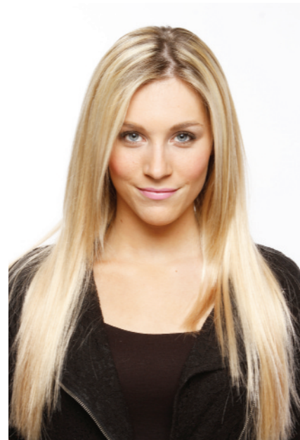
figure 19-45 Client after bonding hair attachment method

Academy Pro Hair Extensions.