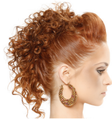
Hair: Acacia Cronic. Elon Salon.