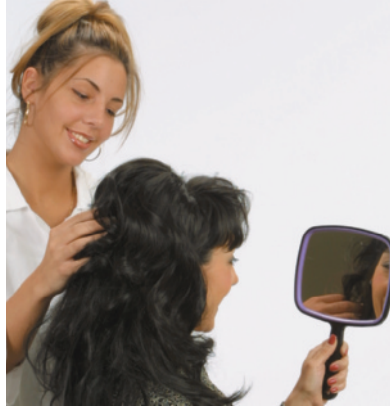
figure 19-29 Adjusting the hairpiece