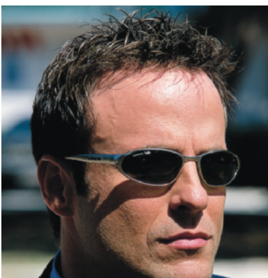
figure 19-20 The same client fitted with a toupee