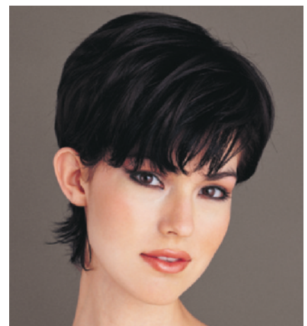
figure 19-16 Hairpieces can look very natural.