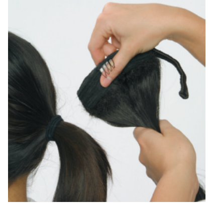
figure 19-23 Attaching the hairpiece

These hairpieces vary in size and usually are constructed on a stiff net base. They are attached, temporarily, with hairpins, clips, combs, bobby pins, or elastic.