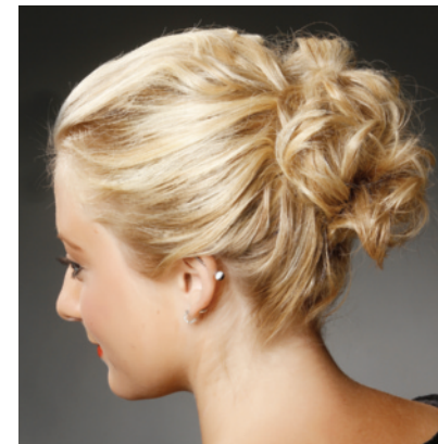
figure 19-34 An easy, dressed-up look