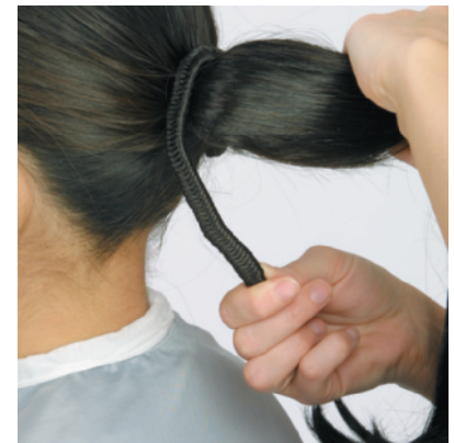
figure 19-24 Wrapping the band around the ponytail base